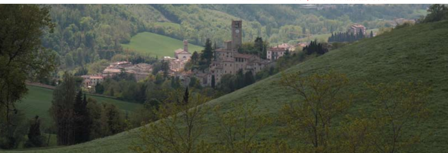
Below, a view of Macerata Feltria

As we gain altitude, Romagna produces a series of interesting and varied wines. Today's quality frontier is on the higher hills: Valturio in Montefeltro (although the headquarters are in the Marche region, the soul of this firm is in Romagna), Poderi dal Nespoli, Pertinello in Galeata, Il Pratello, Villa Papiano, Balìa di Zola, Castelluccio, Vigne dei Boschi in the zone of Modigliana and Brisighella. The Modigliana territory has several wineries experimenting with the characteristics this marnoso-arenacea terrain favors: marked minerality and tannins that stand up to long cellaring.