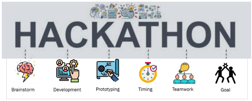
Figure 2 Phases of an Hackathon

MOSAIC International Skills Performance is an interactive, collaborative event in the form of hackathon where, during one week, students from the VET schools part of the consortium (CÉGEP/INOVEM/ENME, HARMONIA1, OMNIA, SCF, SEPR and TUMO Studios), studying in the areas covered by the project, will be gathered in different groups to work together with support from Accompanying Persons, and guidance from the participating Experts, to make the best use out of their technical and creative skills to create a mock-up that is innovative, creative and sustainable , to be displayed on the last day of the event.